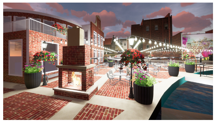
A rendering of the Molengracht courtyard. The Spirit of Pella is working to raise funds to enhance existing spaces in Pella.

"Research and recommendations from The Retail Coach